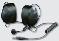
MT Series Headset Neckband Model (NRR 24 dB) Product number: MT7H79B