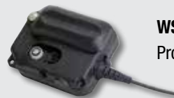
WS Mobile Radio Adaptor Product Number: FL6060-WS5