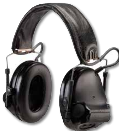
SWAT-TAC, Folding Headband, NRR 23dB