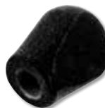
Boom Microphone Windsock, For Electret Microphone Model Headsets