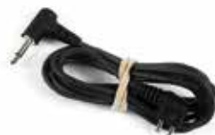
Listen-Only Cables For Headsets With External RX Input Connection, various

Product Number: FL6H 3.5mm mono, 36" straight