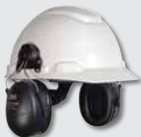
HT Series Listen-Only Hard Hat Mount Model (mono); 3.5mm plug (NRR 23 dB) Product Number: HTM79P3E