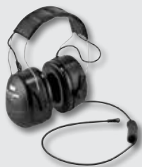
HT Series Listen-Only Headset Headband Model (mono); 2.5mm plug (NRR 25 dB) Product Number: HTM79A-03