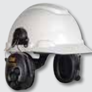
TacticalPRO Headset Hard Hat Mount Model (NRR 22 dB) Product Number: MT15H7P3E SV