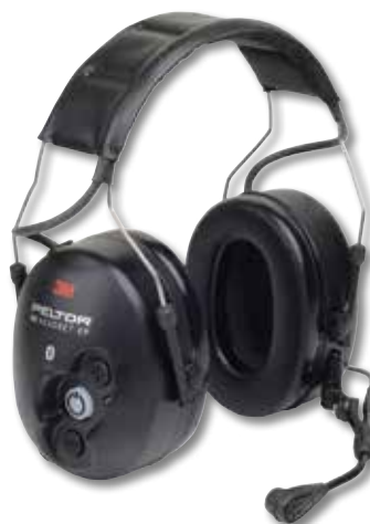
Headband Model, NRR 25 dB Product Number: MT53H7AWS5