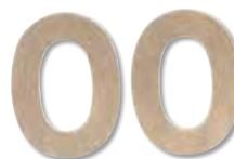
Clean Hygiene Pads, stick to sealing rings for shared use and sweat absorption

Product Number: FL6M-03 2.5mm mono, 8" curly