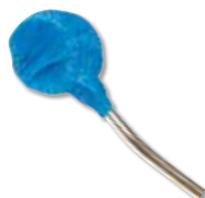
Microphone Wrapping Tape