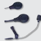
Open Face Helmet Communication Kit, Product Number: MT632