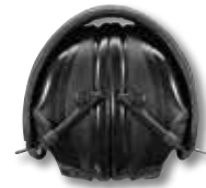
Folding Headband Model, NRR 20 dB