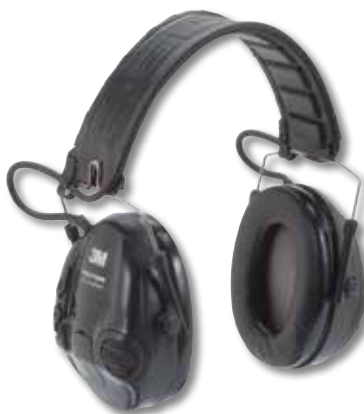
TacticalSport, Folding Headband, NRR 20dB