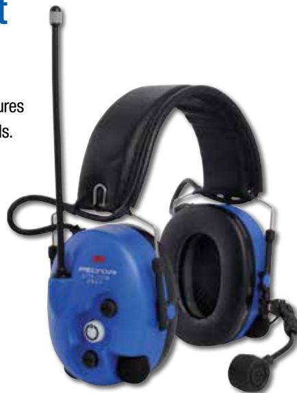
Lite-Com Pro II Headband Model (NRR 25 dB)