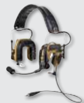
COMTAC IV, Coyote Brown Cup Earcups, Single Comm, NRR 18 dB