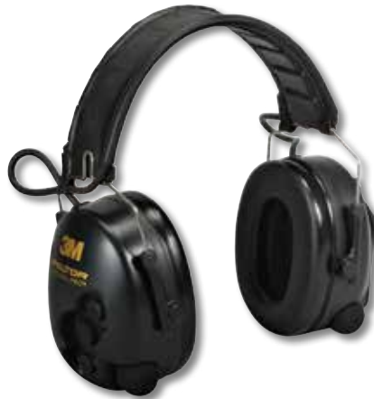
TacticalPRO Folding Headband, NRR 26dB