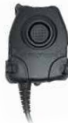
FL5000 Series Radio PTT Adaptor