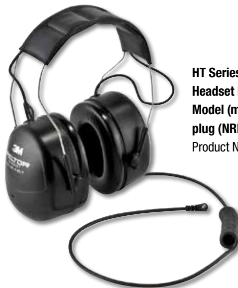
HT Series Listen-Only Headset Headband Model (mono); 3.5mm plug (NRR 25 dB) Product Number: HTM79