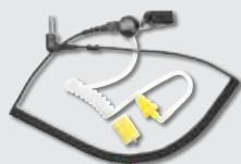
HearPlugs Listen-Only Earpiece (mono); 3.5mm plug, 8" curly cable Product Number: HTM06-02