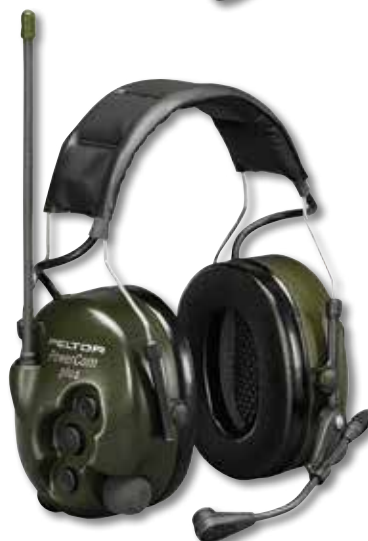
PowerCom PLUS™ Headset Headband Model (NRR 25 dB) Product Number: MT53H7A4610 GN