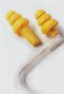
3M™ E-A-R™ UltraFit™ Reusable Communication Earplugs, NRR 21 dB, Sold as a box of 25 pair Product Number: PELTIP1