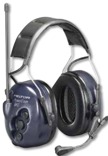
PowerCom BRS Headband Model (NRR 25 dB) Product Number: MT53H7A4604