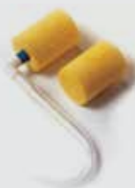
3M™ E-A-R™ Classic™ Disposable Communication Earplugs, NRR 29 dB, Sold as a box of 100 pair Product Number: PELTIP2