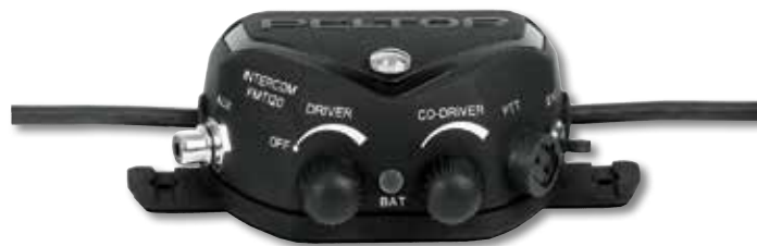
FMT120 Rally Intercom Product Number: FMT120