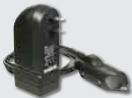
Rechargeable Battery Pack* Product Number: 88009-00000

*Sold separately, not included with original headset purchase.