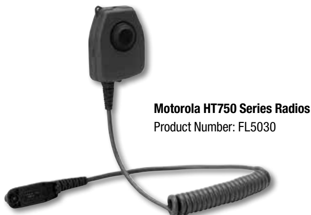
Motorola HT750 Series Radios Product Number: FL5030

For a complete list of radio series adaptors, please call 1-800-665-2942.