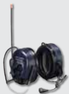
PowerCom BRS Neckband Model (NRR 25 dB) Product Number: MT53H7B4604