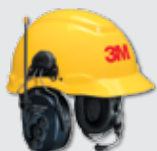
PowerCom BRS Hard Hat Mount Model (NRR 24 dB) Product Number: MT53H7P3E4604