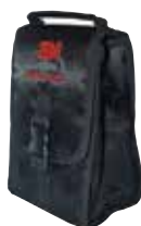
Headset Carrying Bag