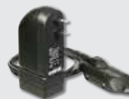
Rechargeable Battery Pack Product Number: 88009-00000