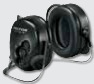
TacticalPRO Headset Neckband Model (NRR 25 dB) Product Number: MT15H7B SV