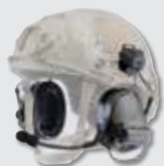
COMTAC ACH, Olive Drab Green Earcups, Single Comm, NRR 20 dB with FAST Helmet Mounting Attachment