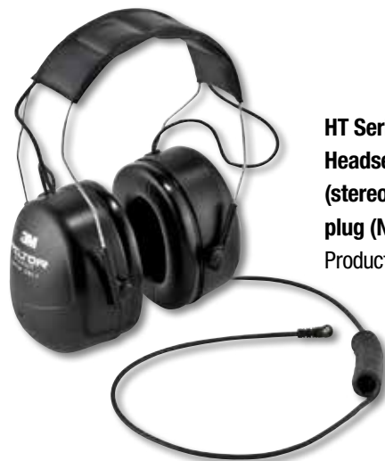
HT Series Listen-Only Headset Headband Model (stereo), 3.5mm stereo plug (NRR 25 dB) Product Number: HTB79A-02