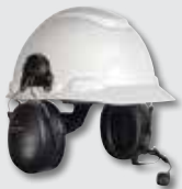
MT Series Headset Hard Hat Mount Model (NRR 21 dB) Product number: MT7H79P3E