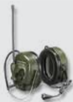
PowerCom PLUS™ Headset Neckband Model (NRR 24 dB) Product Number: MT53H7B4610 GN