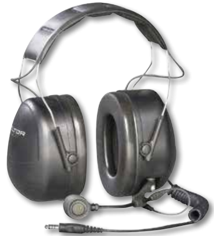
MT Series Headset Headband Model (NRR 25 dB) Product number: MT7H79A

For product number information specific to your radio model needs, contact customer service at 1-800-665-2942.