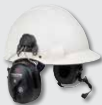
Hard Hat Mount Model, NRR 25 dB Product Number: MT53H7P3EWS5