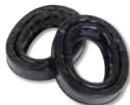
Gel Sealing Ring Upgrade