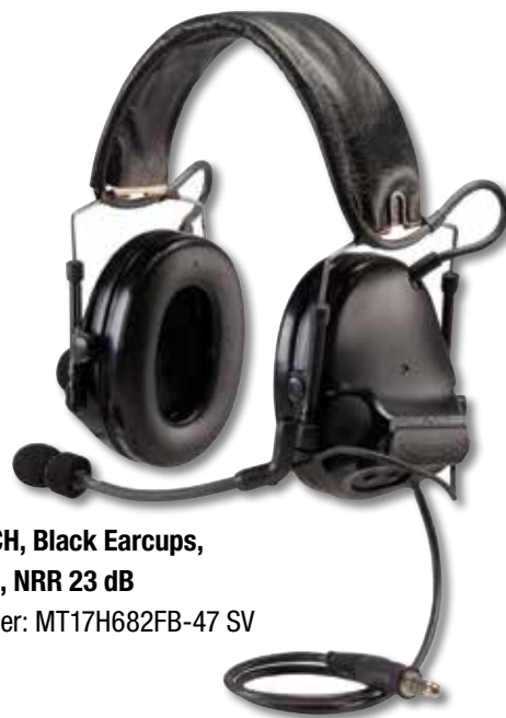
SWAT-TAC ACH, Black Earcups, Single Comm, NRR 23 dB