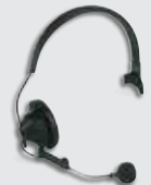
MT Series Headset Lightweight One-sided Product number: MT32H01