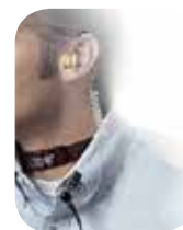
MT Series Headset, Throatmic/Hearplug