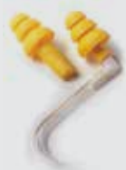
3M™ E-A-R™ UltraFit™ Reusable Communication Earplugs, NRR 21 dB, Sold as a box of 25 pair Product Number: PELTIP1