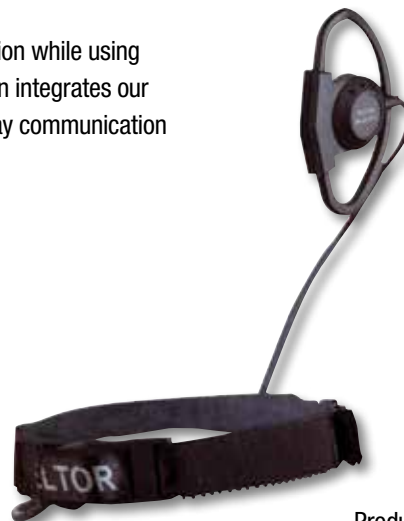
MT Series Headset, Throatmic/Earpiece Product Number: MT9HTM05

Refer to page 8 for list of radio models.