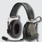
COMTAC ACH, Olive Drab Green Earcups, Single Comm, NRR 23 dB