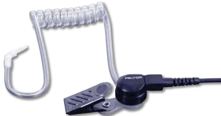
HearPlugs™ Listen-Only Earpiece (mono); 3.5mm plug, 25" straight cable