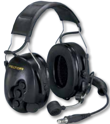
TacticalPRO Headband Model (NRR 25 dB) Product Number: MT15H7A-07 SV