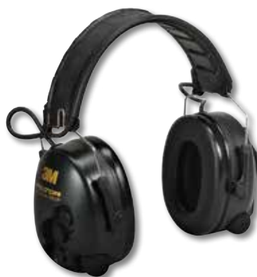
TacticalPRO, Folding Headband, NRR 26dB