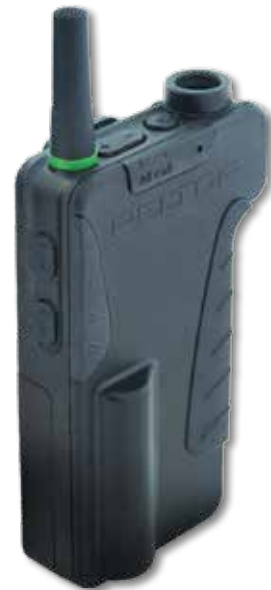
Transceiver, Portable 1.9 GHz Belt Pack Product Number: DC2911

Headset Options: Compatible with 3M™ Peltor™ MT Series Headset Models, see page 7.