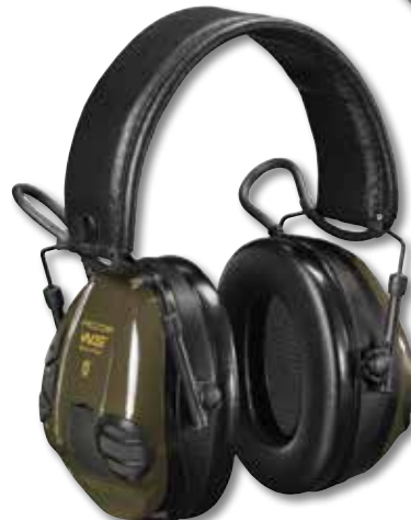
WS Tactical Sport Headset, NRR 20 dB