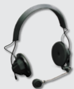
MT Series Headset Lightweight Two-sided Product number: MT32H02