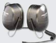
HT Series Listen-Only Headset Neckband Model (mono); 3.5mm plug (NRR 24 dB) Product Number: HTM79B